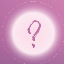
Division I & II