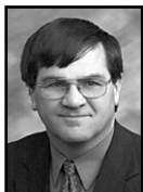
Senator Al Novstrup

12:45 p.m. Better Newspapers Contest Advertising Awards Presentation River Run