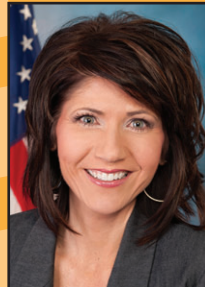
U.S. Representative Kristi Noem