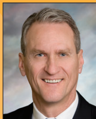
Governor Dennis Daugaard

When Dennis Daugaard was elected as the 32nd governor of South Dakota in 2010, he ushered in a commitment to make government more transparent and accessible that was unparalleled in recent history of the executive branch. Among his first decisions was to make public the invitation lists to governor's events such as the annual pheasant hunt. Gov. Daugaard and Attorney General Jackley in 2012 appointed an open government task force that recommended eight legislative proposals, five of which ultimately became law. The governor has used the power of his office to implement several initiatives to increase accessibility and transparency. He has made available online the minutes and agendas of state boards and commissions. He made state government administrative rules easier to navigate on the state government's website. And Gov. Daugaard has consistently supported the publication of public notices in local newspapers as a way for the taxpayers to know about the business of local governments. During his two terms in office, Gov. Daugaard made a commitment to open government that will serve our state well into the future.