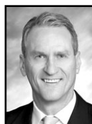
Gov. Dennis Daugaard